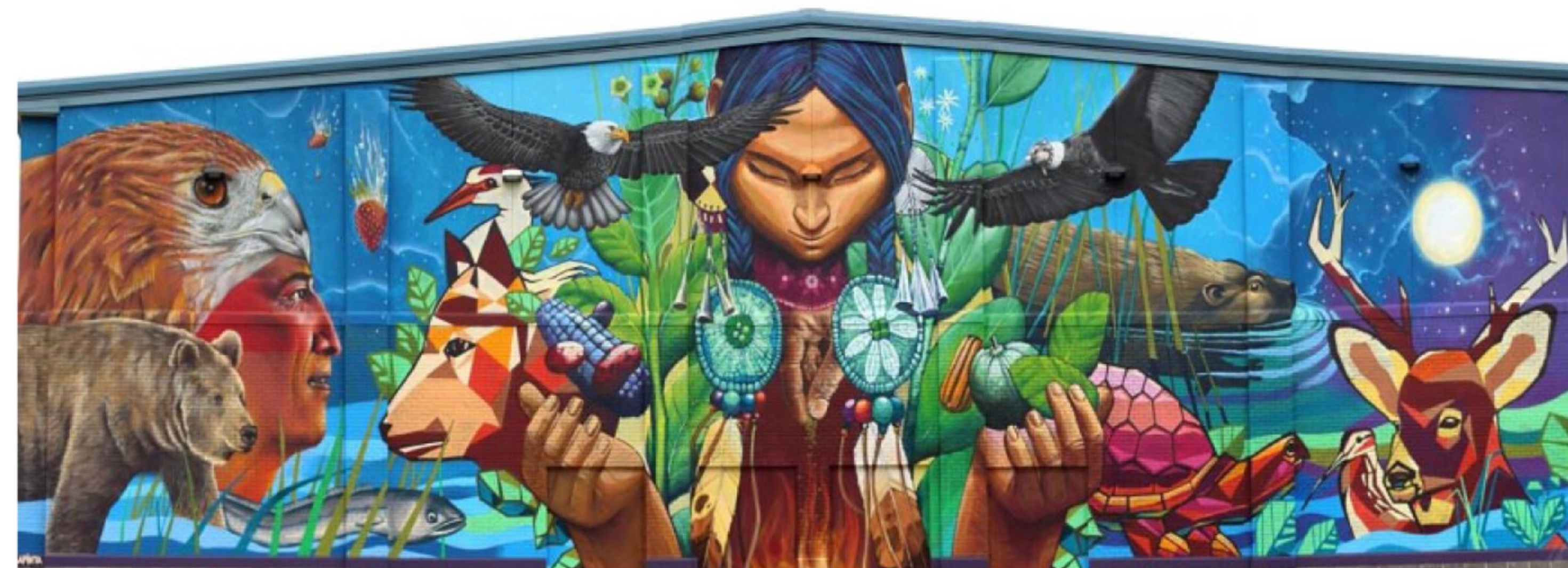
The Six Nations Mural: elements of Haudenosaunee creation story, clans, & Condor prophecy