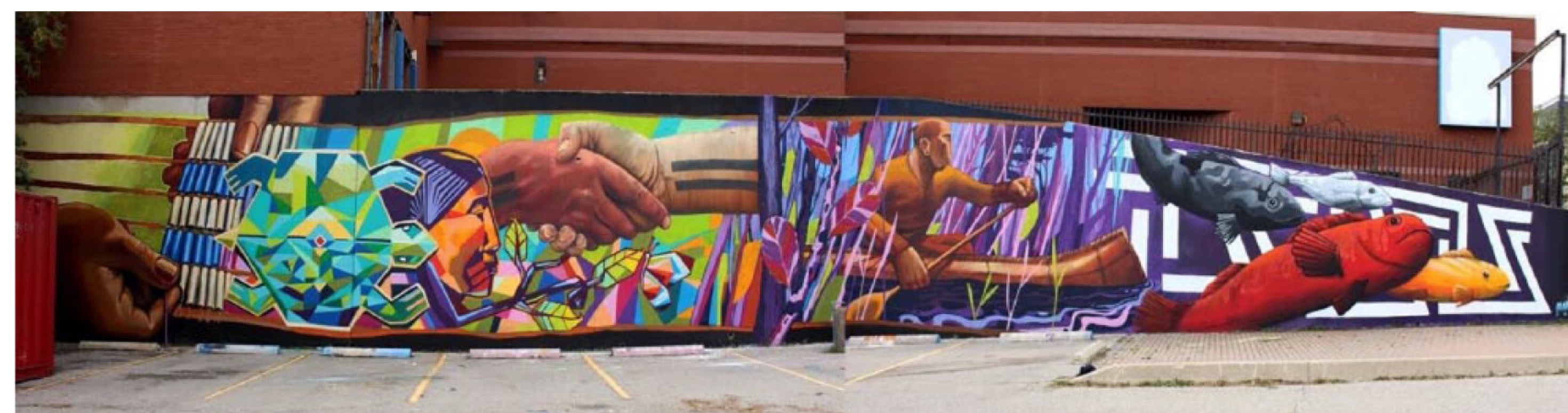
The Brantford Mural: Relationship between non-Indigenous & Indigenous people as they travel down the river